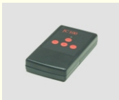
Remote control unit