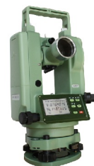
DT202C-Z Auto-collimating theodolite